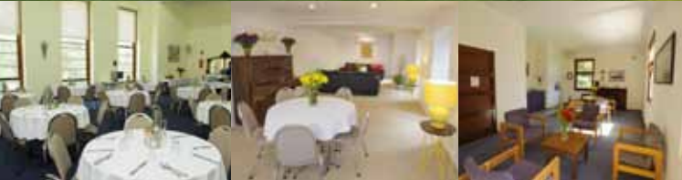
The grounds and facilities of Peter Canisius House

We invite you to join us at the 2023 ANZURA Annual Conference that will be held 25 to 28 August at the delightful Peter Canisius House in Pymble on Sydney's leafy North Shore.