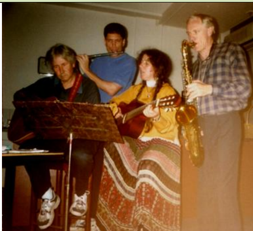
Jazz up the evening