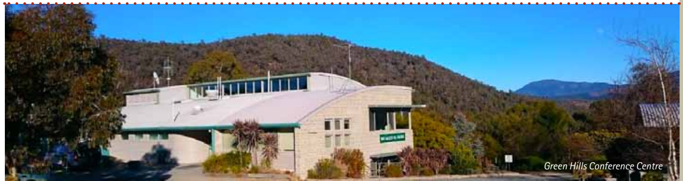
Green Hills Conference Centre