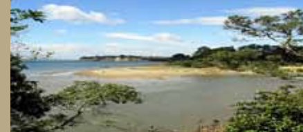
Long Bay NZ

The venue is 44 km from Auckland Airport, and the journey takes between 45 and 70 minutes depending on traffic.