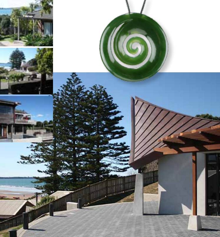
Vaughan Park Anglican Retreat Centre

We invite you to join us at this year's ANZURA conference to celebrate together all of God's gifts to us, and to explore how, individually and together, we may live our lives on Urantia more creatively.