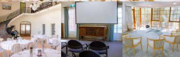
The grounds and facilities of Edmund Rice Centre

This year's ANZURA Annual Conference will be held 4–7 October at the Edmund Rice Centre (Amberley) in Lower Plenty, Melbourne. A retreat and conference venue situated on the Yarra River in Lower Plenty. Nestled on 20 acres of native bushland, we will be surrounded by the peace and tranquility that only the natural bush setting can provide.