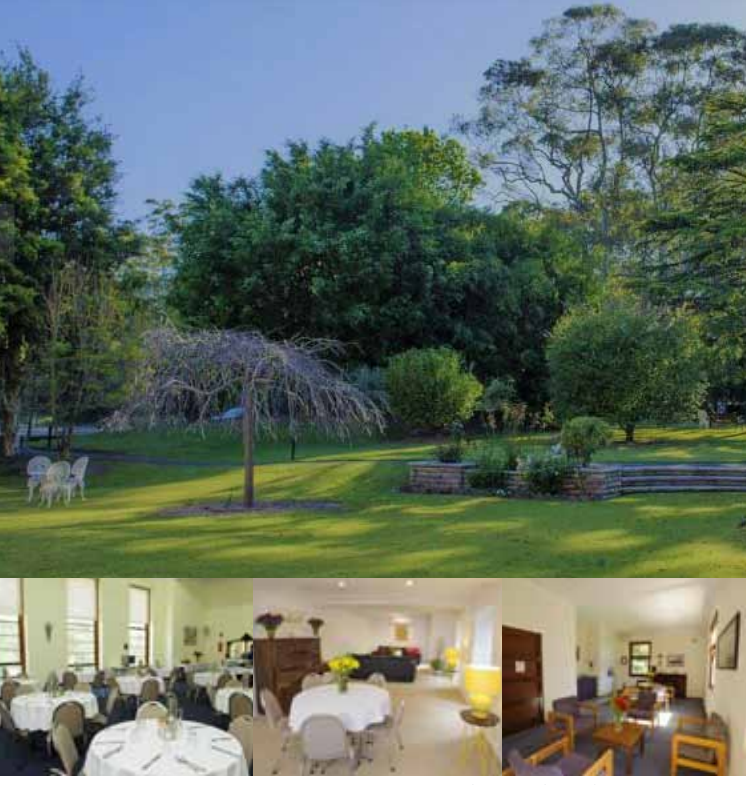
The grounds and facilities of Peter Canisius House

e invite you to join us at the 2023 ANZURA Annual Conference that will be held 25 to 28 August at the delightful Peter Canisius House in Pymble on Sydney's leafy North Shore.